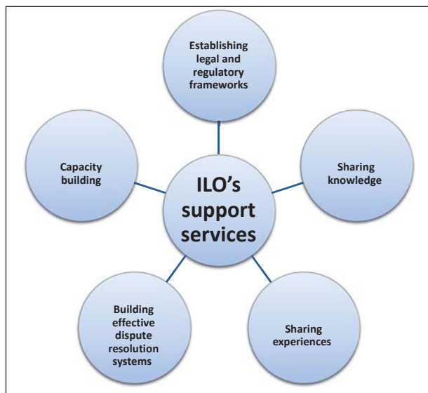
Diagram 2. ILO’s support services for member States

As we have highlighted earlier, court process is not a procedure; this one is a result of procedure transformation to process once a claim have brought to Court. Aforesaid diagram proofs justify of procedural dualism’ postulates, which states in previous papers [12, p. 154–155].