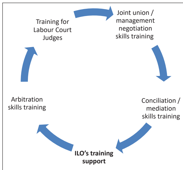
Diagram 4. Additional ILO's services for member States (part 2)

As seen from previous diagram, ILO's standards led to establishing and/or developing the voluntary, effective and financially viable systems of collective labour disputes resolution to soften the social intensity in so vulnerable area as labour disputes.